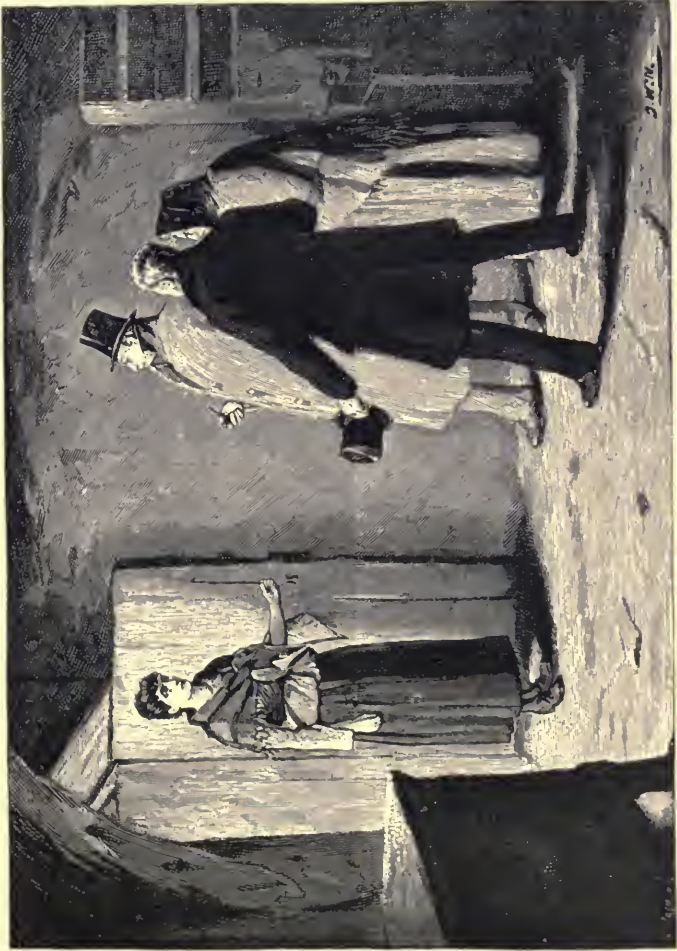
THE EGYPTIAN NOW OPENED THE DOOR.—Page 106.